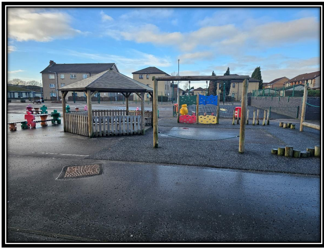
Primary 1 playground

When the bell rings, you line up with your house. Your buddy will show you where and how to line up.